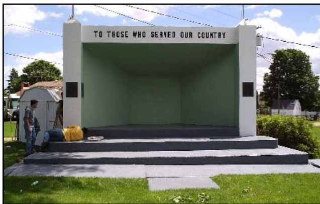
The Beaman Betterment Club was awarded Diamond Vogel paint to beautify the band shell. (pictured above)