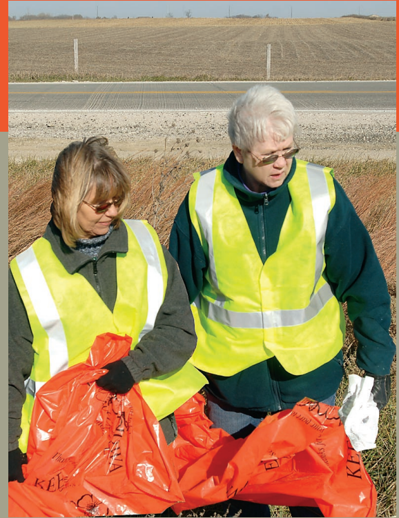
Wearing the required high-visibility vests enhances safety of AAH participants. The vests are available at your local Iowa DOT maintenance facility.

Federal and state laws prohibit employment and/or public accommodation discrimination on the basis of age, color, creed, disability, gender identity, national origin, pregnancy, race, religion, sex, sexual orientation or veteran's status. If you believe you have been discriminated against, please contact the Iowa Civil Rights Commission at 800-457-4416 or Iowa Department of Transportation's affirmative action officer. If you need accommodations because of a disability to access the Iowa Department of Transportation's services, contact the agency's affirmative action officer at 800-262-0003.