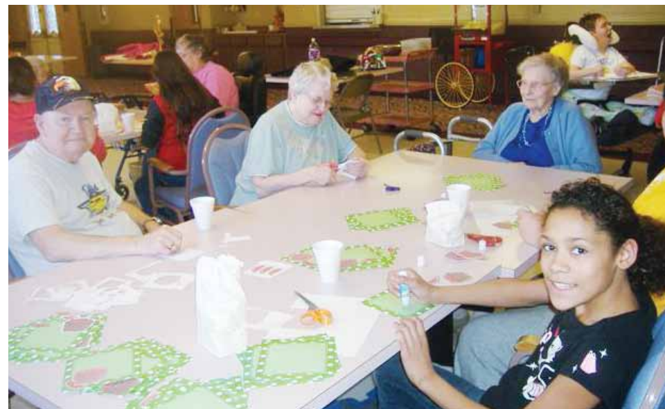
Volunteers and residents design and make seasonal door cards at the Clarion Care Center.